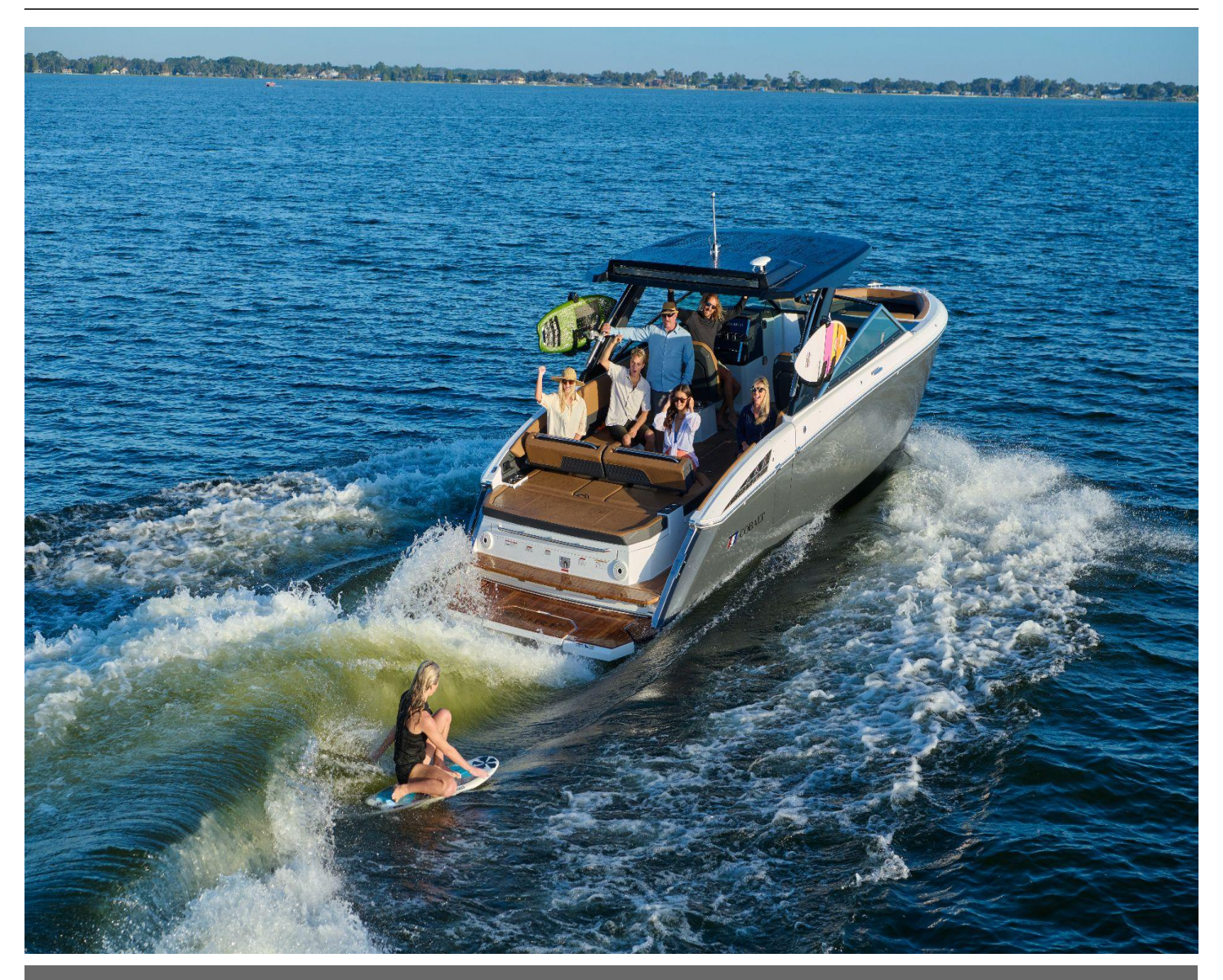
2025 Cobalt R33 Surf